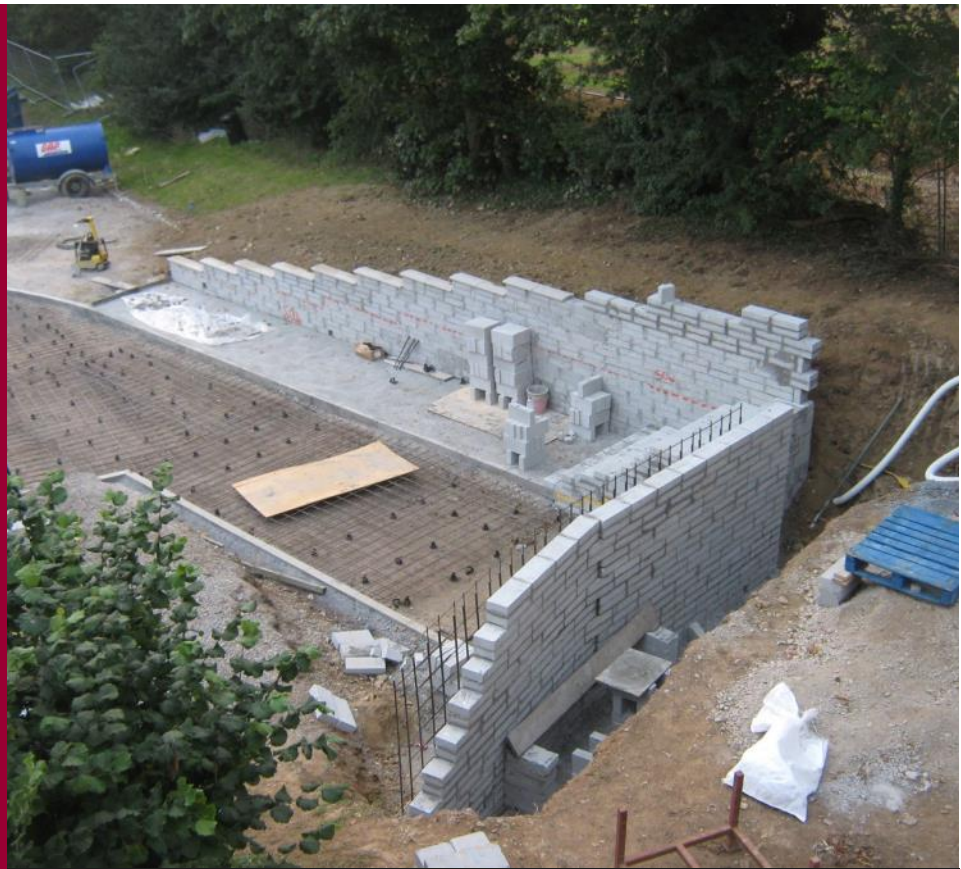
Rear extension under construction