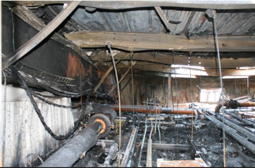
Roof void damage after fire